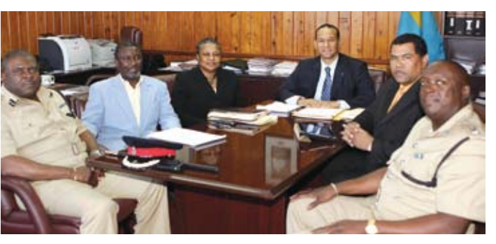
AG and DPP in discussion with Commissioner of Police and senior officers.

result of improving the quality of case preparation by the police and has made it possible for most serious cases to be expedited from the Magistrates' Court to the Supreme Court by use of the voluntary bill of indictment procedure. This has contributed to more cases entering the Supreme Court during 2011 than prior years<sup>21</sup>.