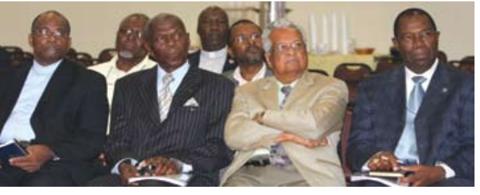
AG discusses Anti Crime Bill with religious leaders in New Providence.