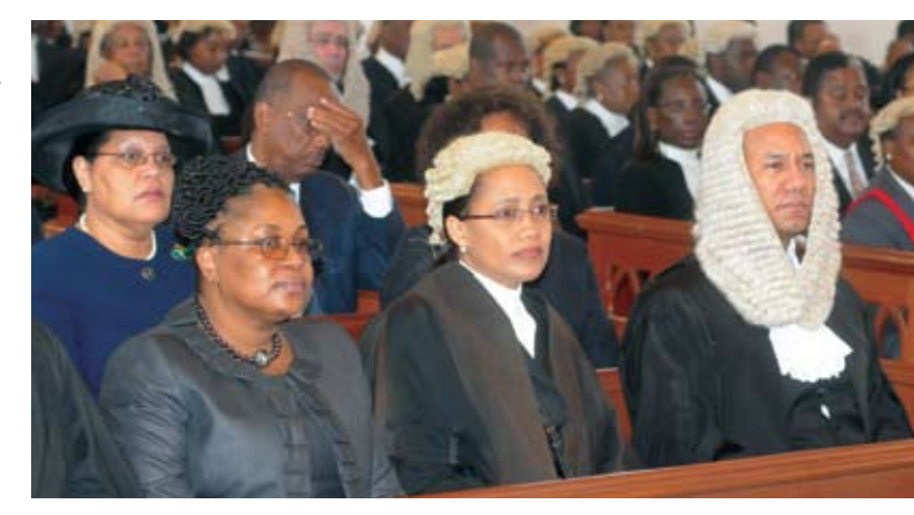
Opening of the 2011 Legal Year at Christ Church Cathedral

Highlights and summary of activities of the Attorney-General and the portfolio agencies during 2011 -