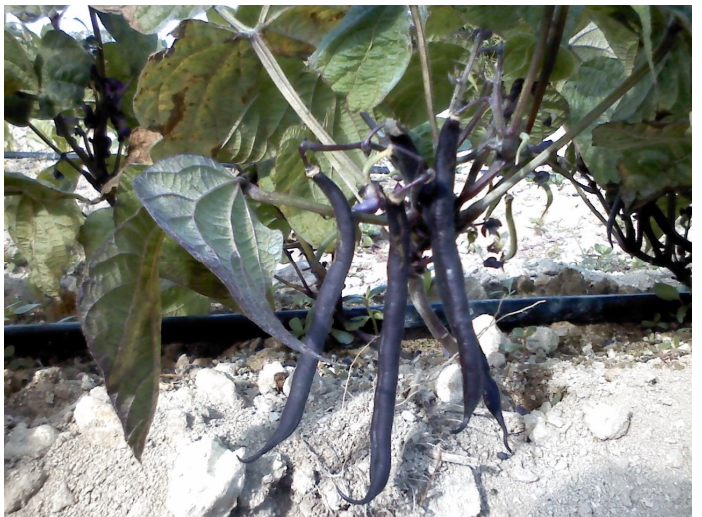
Green bean (Phaseolus vulgaris L.) variety 'Burgundy' at the Gladstone Road Agricultural Centre, 2012

Legume crops are also important for their nitrogen fixing capabilities (Piha and Munns, 1987; Keyser and Li, 1992; Amanuel et al. , 2000), and can be used in crop rotation systems to improve soil conditions. Nitrogen fixation by legume crops offers an alternative to nitrogen fertilisers which may present a serious environmental problem (Nason and Myrold, 1992; Brentrup et al. , 2001). In addition, with increasing interest in organic farming, which requires minimum or zero use of chemical pesticides, bean varieties highly resistant to pests and diseases are in growing demand.