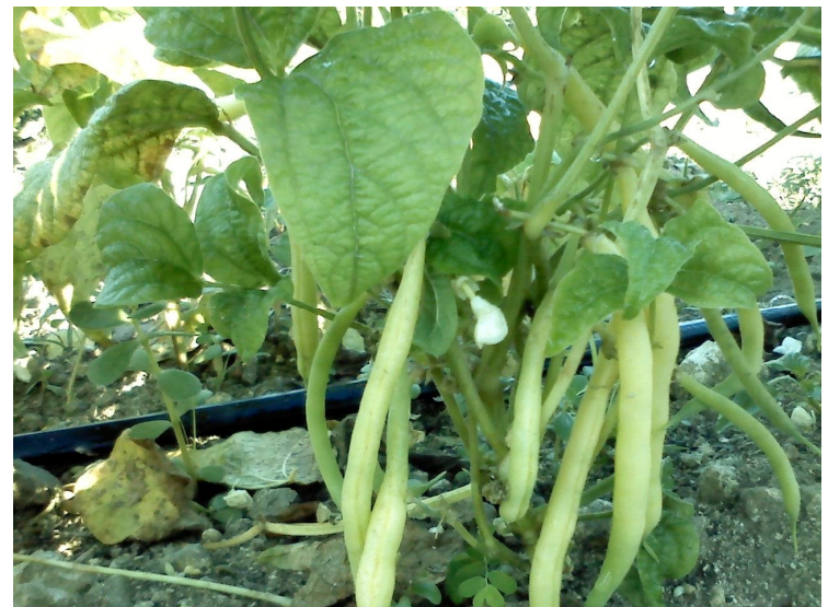
Green bean (Phaseolus vulgaris L.) variety 'Gold Dust' at the Gladstone Road Agricultural Centre, 2012

Four green bean varieties (Phaseolus vulgaris L.) were evaluated in a replicated small plot trial at the Gladstone Road Agricultural Centre during 2012. After 50-70 days of growth, the varieties were assessed for pest and disease tolerance and for pod quality and yield. One of the varieties succumbed to pest and disease problems. There were significant differences among the three surviving varieties with respect to the total number of pods per plant, weight of pods per plant and pod length. Poor harvest quality was observed and this contributed to the low yields recorded for the green bean varieties in this study. The inferior performance of the bean varieties could be attributed to the prevalence of pest and disease problems in the field. Results indicated that green bean cultivation is possible under local conditions, but with proper pest and disease management and the use of varieties resistant to important diseases such as brown rust.