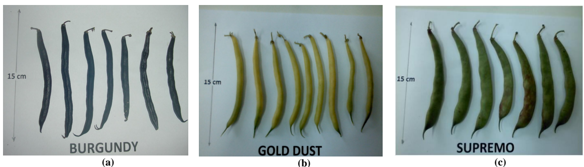
Photo 13. Pods of green bean varieties: (a) 'Burgundy', (b) 'Gold Dust', (c) 'Supremo'.

Photo 13 (a-c) gives some indication of the appearance and quality of the three bean varieties. Pods were generally healthy in appearance, in spite of the prevalence of insect pests and diseases in the field. The variety 'Gold Dust' (13b), in particular, did not display any visible defects that would affect quality. The variety 'Supremo' did have a small number of harvested pods with visible signs of disease. Note that the red speckles on the pods of the variety 'Supremo' (Photo 13c) are characteristic of this variety. This variety was harvested much earlier than the stated number of days to maturity. This had no apparent negative effect on quality, taste or texture of the pods.